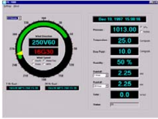
Weather Advisor™ wind dial and weather reporting screen.

The MWP comes with a terminal interface based program that allows monitoring and collections of data. Data can be collected periodically, or real-time.