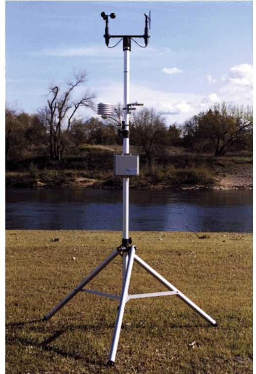
The Micro Weather Pro™ can be deployed using this lightweight 9' aluminum tripod, a 3m steel tripod, or a 30' tower. Anchoring stakes are available for tripod stability.

Mesotech's weather stations are known for their reliability, data measurement precision, durability, and their ability to operate in extreme temperature conditions. Our systems are installed worldwide in locations ranging from the sub-zero conditions of the arctic to the hot and arid conditions of the Sahara.