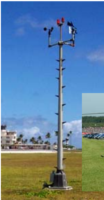
The MicroDCP-32™ is an integral component of our Airport Weather Advisor® System.

With over 20 years experience deploying large-scale instrumentation projects in the weather measurement business, our engineers can help you design, develop, and deliver the most cost-effective solution that meets your needs. In delivering these services, our personnel perform with a thoroughness, professionalism, and integrity few companies can match.