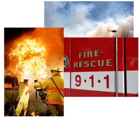
The MicroDCP-32™ is a reliable yet cost-effective component of our HazMat and First Responder stations.

Users can set alarm thresholds to trigger either manual or automatic response to the identified conditions.