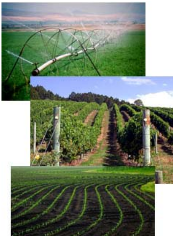
Our MicroDCP-32™ is being used in both agricultural monitoring and research.