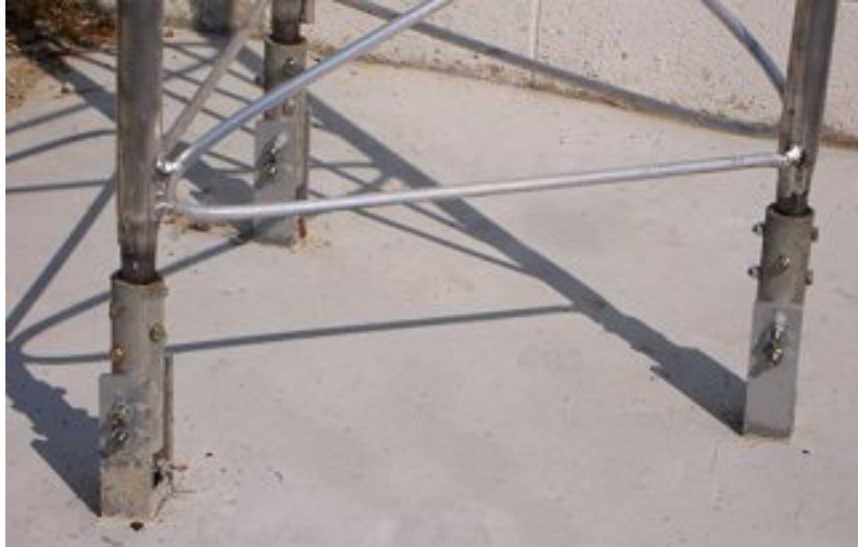
Figure 2 - Proper Installation of Tower Base